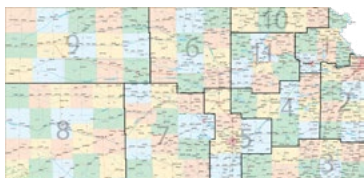
Click map to enlarge.