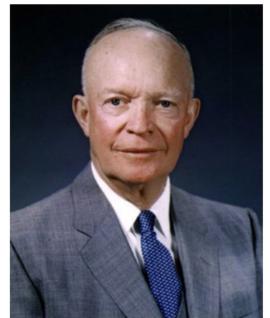
President Dwight D. Eisenhower