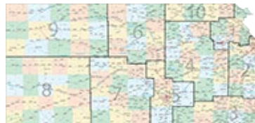
Click map to enlarge.