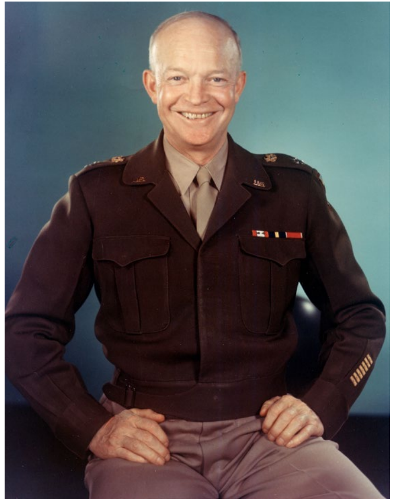
General Eisenhower