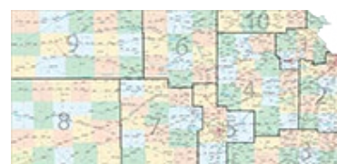
Click map to enlarge.