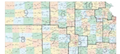
Click map to enlarge.